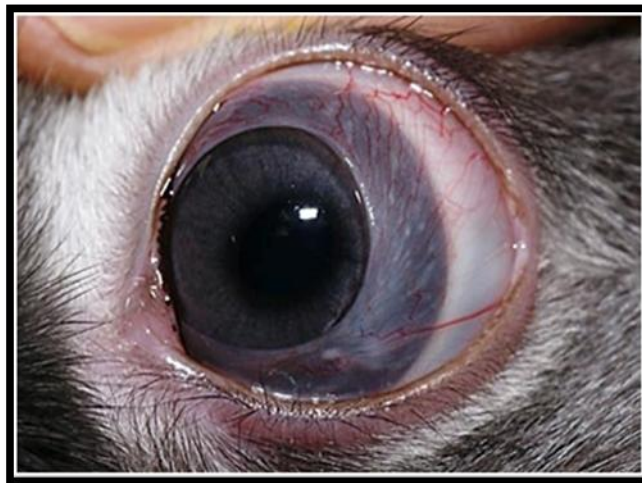
Figure 1: Conjunctival fold stretching over the cornea