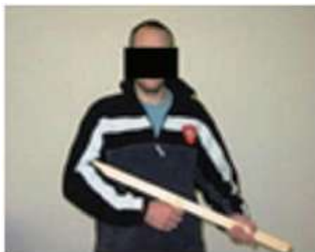
Figure 3: Type of Weapon carrying in current study (Adopted from Birrel et al., 2007)