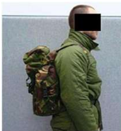
Figure 4: Type of backpack carrying in current study (Adopted from Birrel et al., 2007)