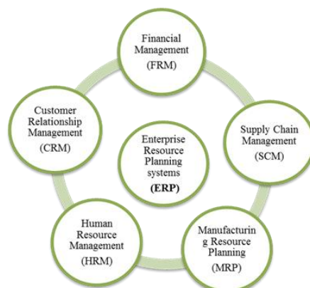
Figure 2: Organization Planning System (Klemonz and others, 2005)