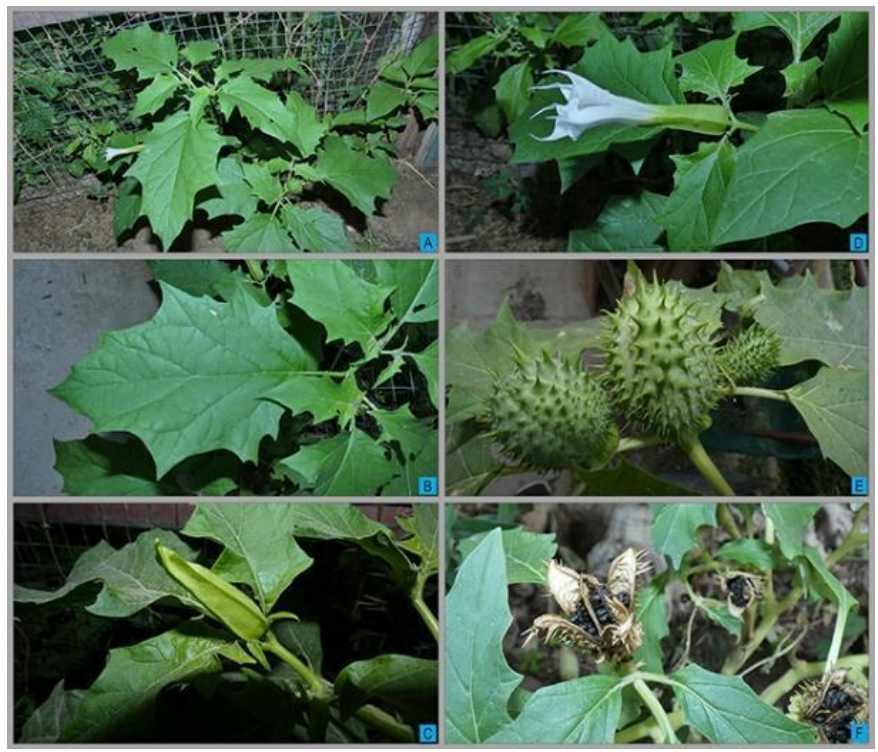
Plate 1: D. stramonium . A - Whole plant. B - Leaves. C - Flower bud. D - Flower. E - Fruits. F - Ripe fruits with seeds.