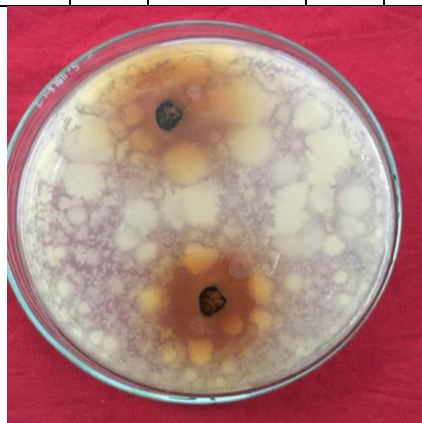
Figure 2: Zone of inhibition in Celastrus paniculata