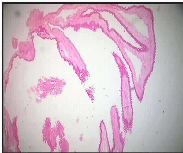
Figure 1: HE x100 Microphotograph of a cyst. cyst wall of cysticercus cellulosae .

Clinically diagnosed as sebaceous cyst, removed and sent for histopathological examination in the department of pathology. Grossly, it was single grey white cystic piece measuring 0.5x0.5cm in size. Microscopic examination revealed a tortuous body of larva which was continuous with cystic layer, (figure1 and figure 2), and diagnosed as cysticercus cellulosae , Taenia solium larva.