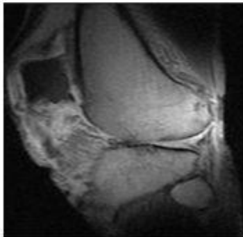
Figure 3 : MRI of the involved knee showing avulsion of the patellar tendon from the tibial tuberosity