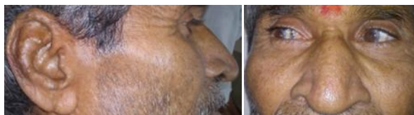
Figure 1a: Photograph of the patient showing pigmented and thickened helix, antihelix and tragus of the ear and pigmented sclera

A 60 year old male presented to our hospital with pain in the right knee following a history of trivial trauma. Subsequent to the trauma he was unable to walk unaided or climb stairs. He had a history of long standing back and knee pain. Clinically there was tenderness of the patellar tendon and inability to perform an active straight leg raise test. Avulsion of the patellar tendon was suspected. The patient had a pigmented sclera, thickened and pigmented, helix, antihelix and tragus, pigmented and thickened palmar skin (Figure 1a, b).