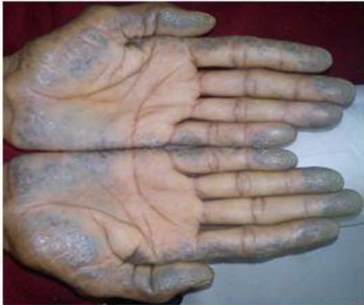
Figure 1b : Photograph showing thickened and pigmented palms