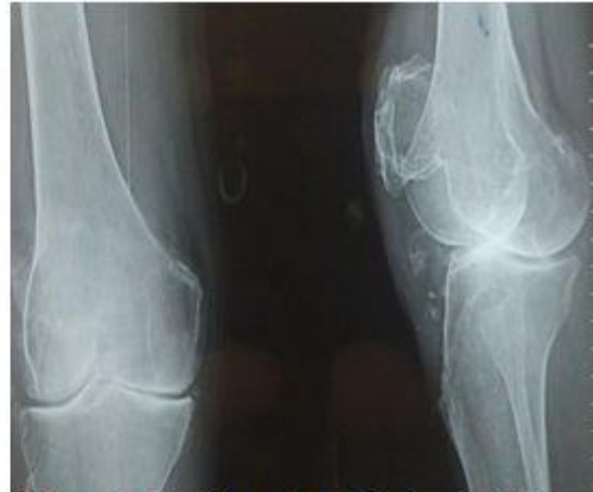
Figure 2 : Radiograph of the involved knee showing high riding patella and degenerative arthrosis