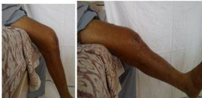
Figure 6 : Two months post surgery and after removal of defunct wire, patient is able to actively extend the knee joint