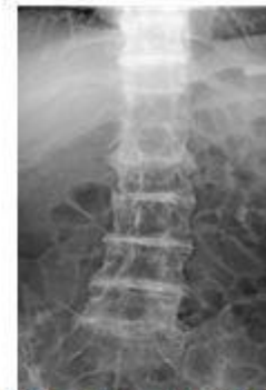
Figure 7 : Radiograph of the spine showing calcified intervertebral discs