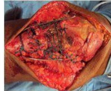
Figure 5 : Tenodesis of the patellar tendon and protection of the repair with an 18 gauge defunct stainless steel wire