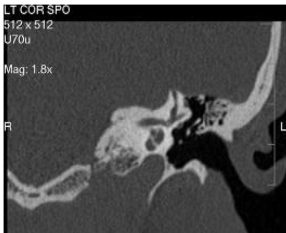
Figure 1 : CT scan image of mastoid bone shadow in right hilum with increased broncho-vascular markings. Pus aspirated from pre-auricular

A 55 year old female was hospitalized with complaints of discharge from right ear for 6 months, swelling in front and behind the right ear for 1 month, and pus discharging sinus behind the ear for 15 days. General examination revealed average nutrition and build and enlarged, matted and nontender cervical lymph nodes on right side of neck (8 cm X 5 cm). Local examination showed one fluctuant, nontender swelling (2.5 cm) in front of the right ear and the post-auricular area showed 3 swellings (about 2 cms each) just behind the retro-auricular sulcus. The upper and lower swellings were tender and fluctuant. The middle swelling had a pus discharging sinus, which was fixed to the underlying bone. External ear canal revealed exuberant pale granulation tissue completely blocking the view of tympanic membrane. Investigations showed : Hb 12 g%, TLC 8,9007 cu mm; DLC P-60, L-34, E-4, M-2; ESR 16 mm for first hour; random blood sugar 80 mg% and urine- normal. Mantoux test was positive. CT scan of Rt. mastoid showed evidence of bony destruction (Figure 1). X-ray chest showed an almond sized radio-opaque