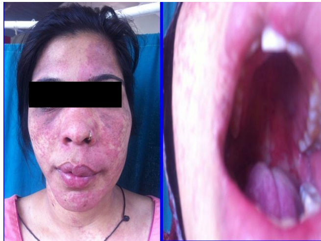
Figure 1: Port wine stains over face and oral cavity; left half of face was larger than right half of face