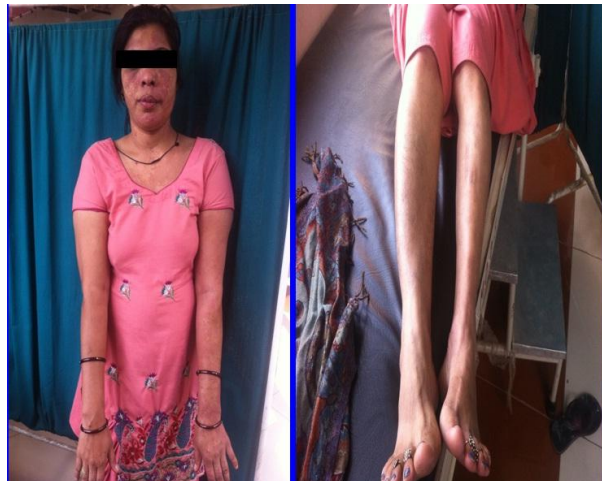
Figure 2: left upper limb was more bulky; right lower limb was more bulky and larger than the left lower limb.