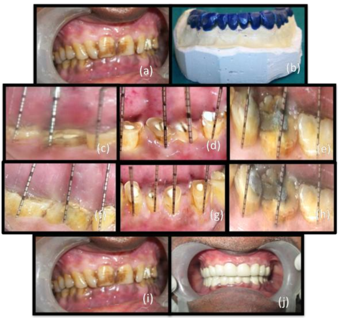
Figure 1(B): Comparison of Pre and Post Operative: (a) Pre-operative (b) Surgical stent preparation on cast (c), (d) and (e) Pre-operative crown height (f), (g) and (h) Post-operative crown height (i) and (j) Comparison of pre and post operative

Similar surgical crown extension was planned but the area of concern was mandibular teeth. Diagnostic waxing was accomplished and template was fabricated with the use of stock artificial teeth to anticipate contour and dimensions of future artificial crowns. The template was trial seated intraorally to ensure stability. Sounding of the alveolar crest was accomplished at this visit, under local anesthesia, with a UNC15 probe (Hu-Friedy Co Inc, Chicago, Ill.) to determine the height of supracrestal gingival tissue, which averaged 4 mm. A facial scalloped surgical incision was outlined 2 mm submarginal, following the surgical template from mandibular left molar to right molar .From analysis of the template, it was obvious that the position of the alveolar crest was already 3 mm from a future finishing line for the planned restoration of the right canine, and only minimal ostectomy was necessary for remaining anterior teeth. Bone recontouring, both facially and lingually, was initiated with the use of a round diamond stone mounted on a high-speed handpiece with copious water irrigation, followed by contouring with hand instruments. After the planned dimensions were achieved, the flap was sutured with 4-0 silk interrupted sutures. Post-operative medication and instructions were given to the patient. Final prosthesis was given after 6 months.