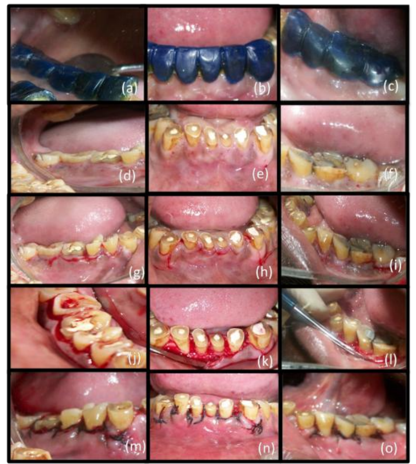
Figure 2(A): Intra-operative: (a), (b) and (c) Pre-operative stent placement for marking desired crown height (d), (e) and (f) Marking at desired crown length (g), (h) and (i) Incision (j), (k) and (l) Resective osseous surgery (m), (n) and (o) Sutures in place

A 55-year-old man presented to the Ahmedabad Dental College with the chief complaint of lack of posterior occlusion and generalized severe tooth attrition. The patient described untreated nocturnal bruxism.