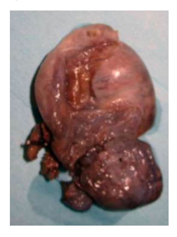
Figure 1: Gross appearance showing ectopic adrenal tissue in lower pole of testes

during development. They may contain cortical tissue only or both cortex and medulla depending whether the fragments break off before or after the migration of neural crest cells into cortex which forms the adrenal medulla. The more distant adrenal tissue which migrates with the developing gonad contains cortex only (Anderson et al. , 1980). In fishes the cortex and medulla occur normally as separate organs. In higher animals there is an increasingly closer association between the two parts until the climax is reached in mammals where the cortex encloses the medulla. Ectopic adrenal tissue usually atrophies so that it occurs in 1% of adults only.