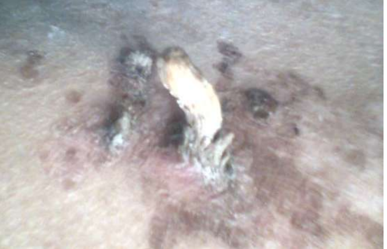
Figure 3: Photograph showing cutaneous horn yellow-white in color, curved and twisted in shape. Surrounding the base of it and the intervening skin between the multiple, smaller cornu cutaneum are hyperpigmented plaques