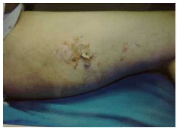
Figure 2: Photograph showing cutaneous horn yellow-white in color, curved and twisted in shape. Surrounding the base of it and the intervening skin between the multiple, smaller cornu cutaneum are hyperpigmented plaques