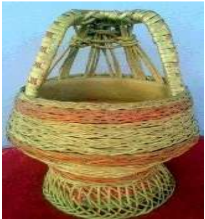
Figure 1: Kangri also known as kanger, is a brazier, a pot filled with embers to provide heat in extreme cold by Kashmiri people