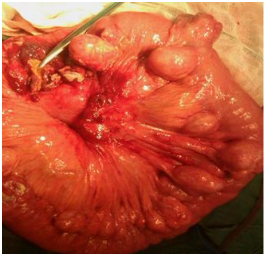
Figure 4: Intraoperative findings: Multiple giant diverticula arising at the mesenteric border of the jejunum, and one of them was perforated

Jejunal diverticula are more common in elderly males (58%). They commonly affected proximal part of jejunum (75%), followed by the distal jejunum (20%) and the ileum (5%). The diverticula of jejunum can be present with diverticula of colon (30-75%), duodenum (15-42%), esophagus (2%), stomach (2%) and urinary bladder (12%) of the patients (Englund and Jensen, 1986). But multiple diverticulosis of jejunum is an uncommon pathology of the small bowel (Singal et al. , 2012; Evangelos et al. , 2011). Jejunal diverticulosis should be suspected in patients those presenting with crampy abdominal pain and altered bowel habits (Singal et al. , 2012; Evangelos et al. , 2011). The disease is usually asymptomatic and must be one of our diagnoses in cases of unexplained malabsorption, anemia, chronic abdominal pain or obstruction and peritonitis (Singal et al. , 2012; Evangelos et al. , 2011) as our case which present with perforation and peritonitis. In a reviewed of the literature and they noted symptomatic diverticula present in 29% of the cases (Evangelos et al. , 2011). Diagnostic perspective of Jejunal diverticulosis is a challenging because there are no truly reliable diagnostic tests (Singal et al. , 2012). Diagnosis is usually