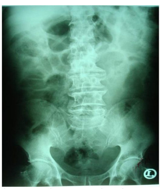
Figure 1: Abdominal X-ray displayed multiple dilated loops of small bowel