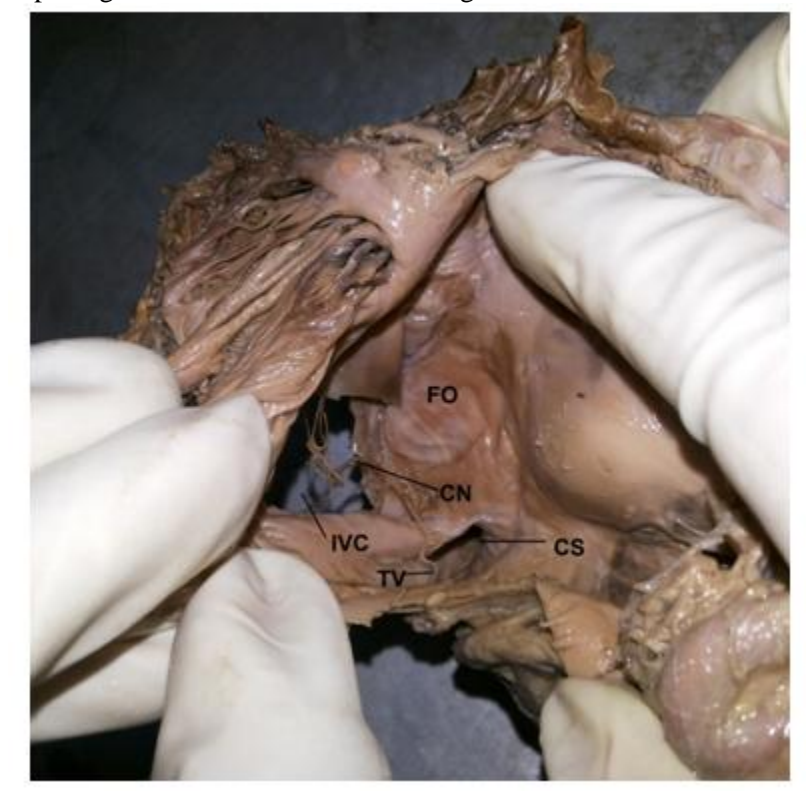
Figure 1: Chiari network covering the orifice of Inferior vena cava

Out of 40 specimens, in 27 specimens Eustachian valve was seen to be present. In 13 hearts it was absent. In these 27 specimens, the size and thickness of Eustachian valve varied. It was either thin crescent like or thick ridge or was seen as a network of fibers (Chiari network) associated with or without EV. Out of 27 cases where it was present, in 11 cases the valve was membranous crescent like. In 10 cases, it was seen to be thick ridge like. In 6 cases Chiari network was seen. Out of the 6 specimens, in one specimen the network of fibers was seen extending from Eustachian valve to fossa ovalis. In three specimens, it extended from Eustachian valve to the coronary sinus opening covering its entire orifice. There was a specimen where Chiari network extended from Thebasian valve to interatrial septum and it passed over the orifice of coronary sinus. An extensive Chiari network was seen in a case where it extended from Thebasian valve till opening of inferior vena cava covering the entire orifice of inferior vena cava.