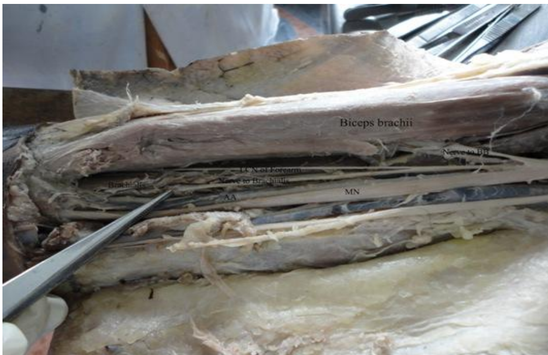
Figure 2: Showing MN innervating the flexor muscles of arm