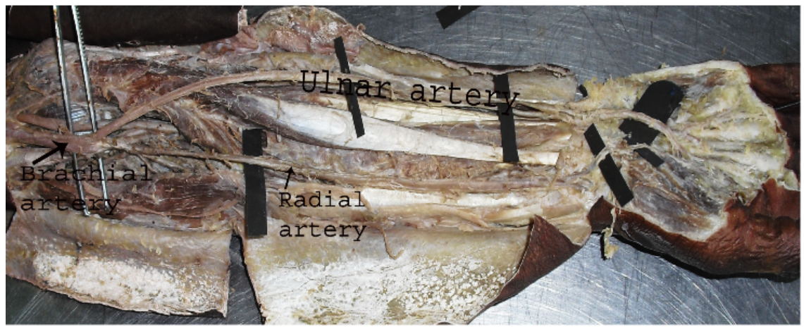
Fig 1: Showing ulnar artery superficial to all flexor muscles of forearm.

Kithsiri et al. , (2007) and Srinivasulu Reddy et al. , (2007) have reported superficial ulnar artery piercing brachial fascia and becoming superficial to antebrachial fascia and passed superficial in forearm. In the present case however, the ulnar artery is deep to antebrachial fascia bur superficial to flexor group of muscles.