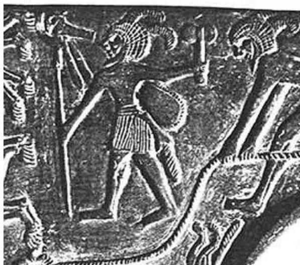
Tehenu depicted on Amratian pottery

The Hatti people often referred to themselves as Kashkas or Kaskas. The C-Group people occupied the Sudan and Fezzan regions between 3700-1300 BC, The C-Group were called Tmhwh (Temehus). The Temehus were organized into two groups the Thnw (Tehenu) in the North and the Nhsj (Nehesy) in the South. A Tehenu personage is depicted on Amratian period pottery. The Tehenu wore pointed beard, phallic-sheath and feathers on their head.