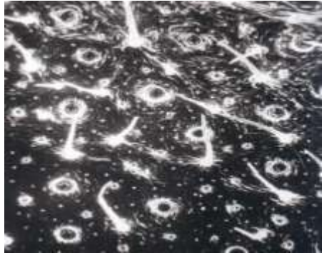
Figure 2: Control: Normal Volatile glands UVB treated –Increased Volatile oil Glands Plate 1: Trichomes and Volatile oil glands characteristics of leaves of 25days of Ocimum basilicum L. under control condition and enhanced UV-B radiation exposure.