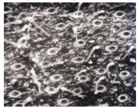
Figure 1: Control-Normal Trichomes

The Ocimum plants developed some strategies against enhanced UVB radiation including morphology