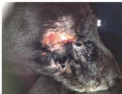
Figure 1: Wound on Right Upper Eyelid with Serosanguinous Discharge

Six years old, Spitz cross intact male was presented with wound on right upper eyelid with swelling on periorbital tissue and face, serosanguinous discharge (Figure 1). On clinical examination revealed external ophthalmomyiasis.