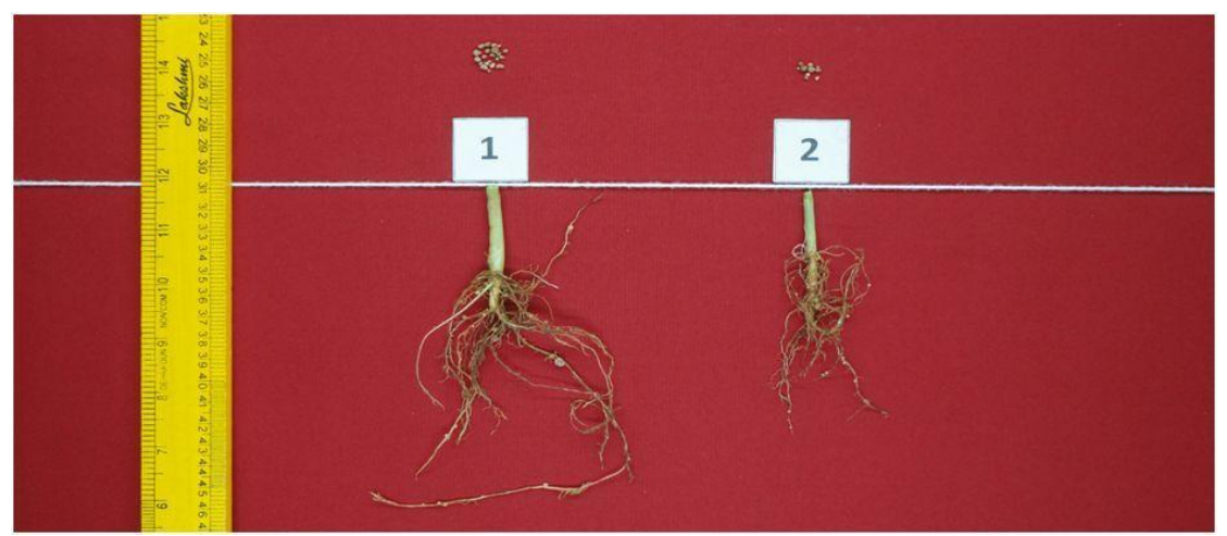
Figure 2: NVL-585