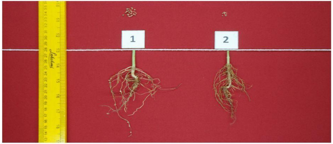
Figure 3: VAMBAN-2

Plate 1: Comparative gross morphology of root systems showing nodulation in three varieties of Vigna radiata (L.) Wilczek on 30 DAS (1: Control, 2: UV-B)