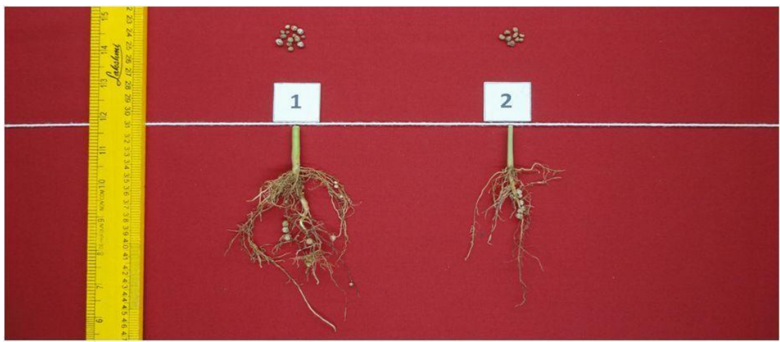
Figure 1: CO-8

International Journal of Food, Agriculture and Veterinary Sciences ISSN: 2277-209X (Online) An Open Access, Online International Journal Available at http://www.cibtech.org/jfav.htm 2015 Vol. 5 (3) September-December, pp. 75-79/Rajendiran et al. Research Article