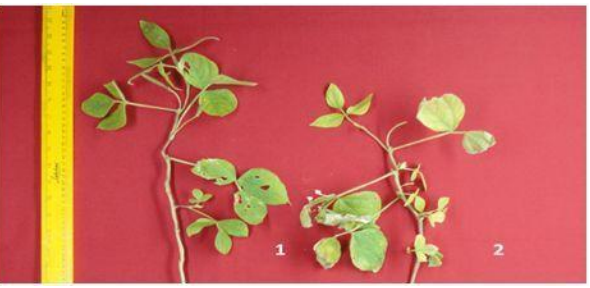
Figure 7: 60 DAS plant tops