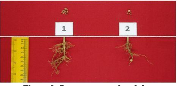
Figure 8: Root system and nodules