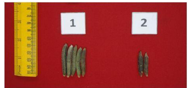
Figure 9: Pods