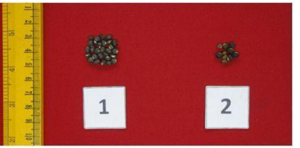
Figure 10: Seeds

Plate 1: First fully expanded trifoliate leaves, foliar injuries, plant tops and yield of Vigna mungo (L.) Hepper var. VAMBAN-4 (1: Control, 2: UV-B)