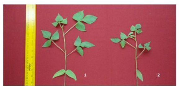
Figure 3: 30 DAS plants