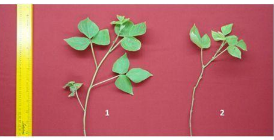
Figure 4: 45 DAS plants