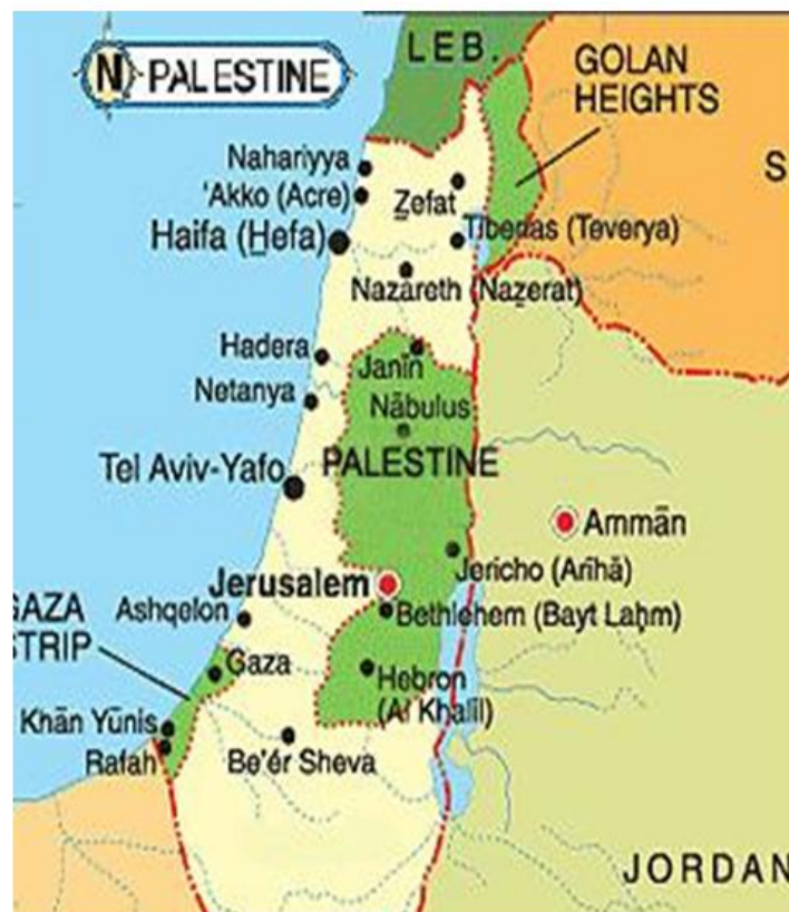
Figure 1: Palestine map