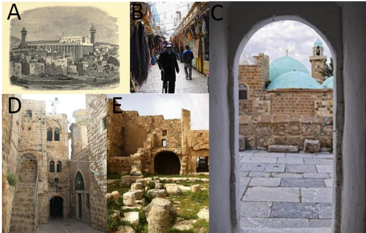
Figure 2: A – The Ibrahimi Mosque. B- Hebron Old City. C – A Mosque in the Old City of Hebron. D – Buildings in the Old City of Hebron. E –Old