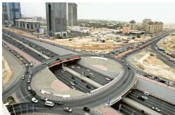
Figure 3: Uplifted Roundabout

Source: http://gulfnews.com/news/gulf/uae/traffic-transport/dh617m-first-interchange-complete-in-dubai-1.998545