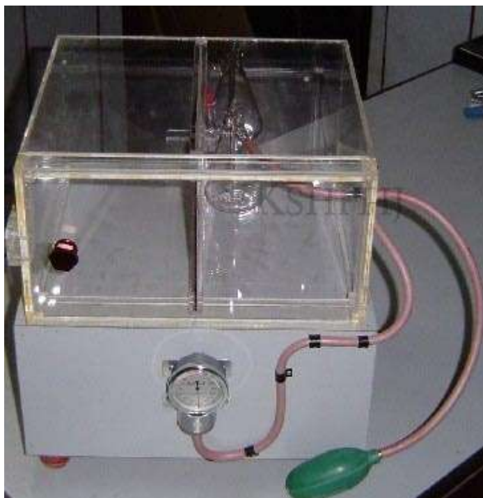
Figure 2: Histamine chamber