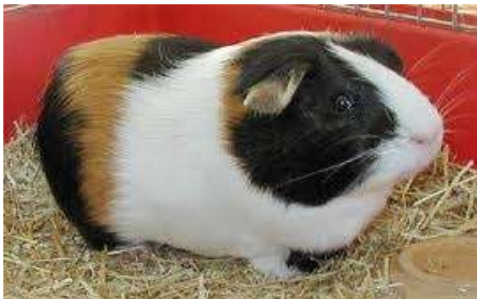
Figure 1: Guinea pig