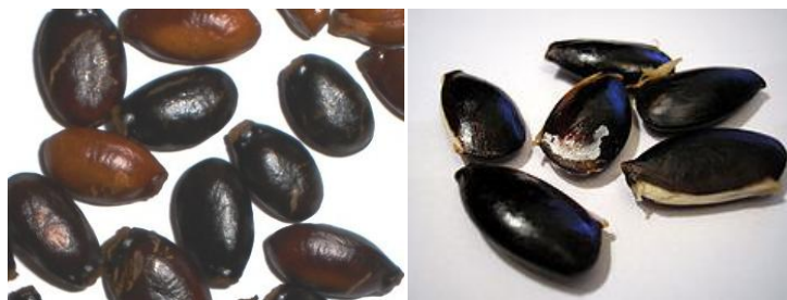
Figure 1: Seeds of Annona squamosa (L) and Manilkara zapota (L.)

Annona squamosa (L) belongs to Annonaceae family, commonly called as custard apple. Literatures of many research works prove that every parts of A.squamosa has medicinal property. Manilkara zapota (L.) commonly known as Sapodilla or Sofeda belongs to the family Sapotaceae. It has been used in the indigenous system of medicine for the treatment of various ailments. From the ethnobotanical studies we found that both are having good antifungal activity and can be used as anti-fungal agents. The present study was aimed at screening Hydro alcoholic extracts of two different plant seeds viz. Manilkara zapota L (Sapotaceae), Annona Squamosa L (Annonaceae), for their antifungal activity. From our literature survey we came to know that very few works have been carried out on seeds for other activity. So we are taking seeds of Manilkara zapota and Annona Squamosa for determining antifungal activity against the fungi like Aspergillus niger and Candida albicans (Dang et al., 2011; Pandey et al., 2014; Nandhakumar and Indumathi, 2013).