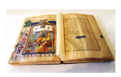
Figure 10 Figure 9 Figure 8 Figure 7