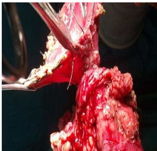
Figure 2: Site of Rectal Stenosis

After pre-anaesthetic evaluation the patient was operated for transverse loop colostomy for diversion under general anaesthesia. In second stage after six months, patient was operated for posterior sagittal anorectoplasty. A narrow segment of 4-cm length found in distal part of rectum was excised (Figure 2). Anorectal anastomosis was done (Figure 3). Post operative anal dilatation was advised. After confirming adequacy of anastomosis, continuity of gut was restored. Histopathologic examination of resected specimen was suggestive of chronic inflammation and associated fibrosis. In follow up patient is doing well except faecal incontinence for first few months.