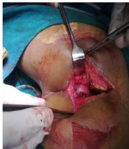
Figure 3: Anorectal Anastomosis